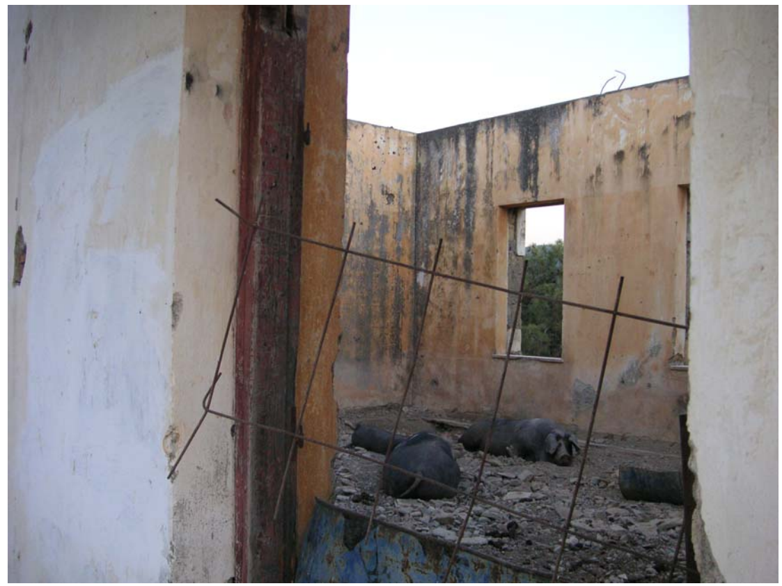
Figure 6: the remains of Mansoura/Mansura reused as a farm

Indeed, former United Nations peacekeeper and political geographer Richard Patrick (1976: 78) observed that '[m]ost of the abandoned villages and quarters were ransacked and even burned by Greek-Cypriots':