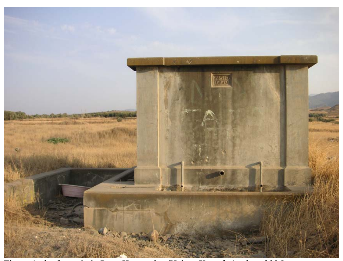
Figure 1: the fountain in Pano Koutraphas/Yukarı Kutrafa (author, 2006)

Kokkina/Koççina is still a Turkish Cypriot exclave now, but Vassos Lyssarides and Nikos Sampson's paramilitaries did clear Sellain t'Api, Ayios Theodoros, Alevga and Mansoura (Borowiec 2000: 62-63; der Spiegel 1964: 55). Local Greek Cypriots confirmed my finding of the ruins of Alevga/Alevka, now used as a farm (fig. 5), while UNFICYP troops confirmed my finding of the ruins of Mansoura/Mansura (fig. 6), also used as a farm.