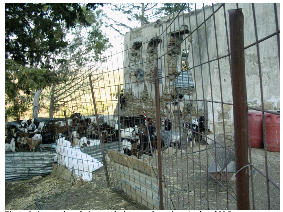
Figure 5: the remains of Alevga/Alevka reused as a farm